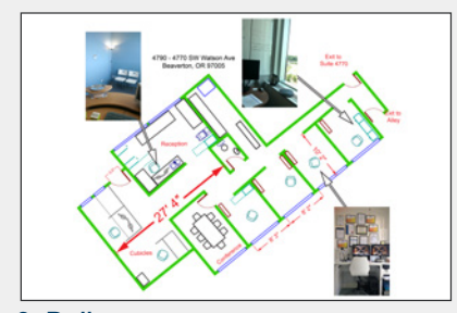
3. Deliver plans in compatible formats for instant access and viewing.