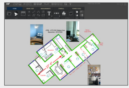
2. Process floor plans into 2D diagrams easily using FARO Zone software (2D or 3D).